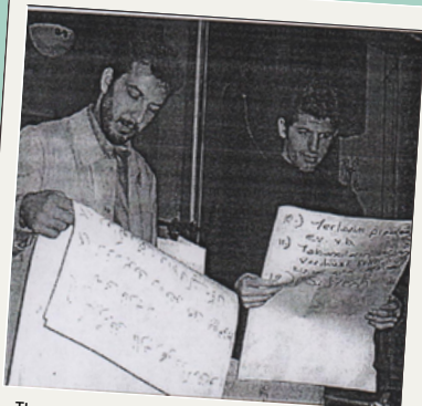
The conference brought together refugees and supporters to campaign, connect, and share interests.

In our early days, we campaigned to prevent the deportation of families, vigorously defending the human rights of those escaping oppression or conflict.