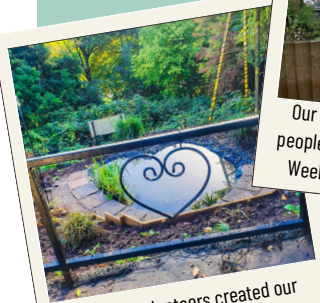
In 2021, volunteers created our Grassroots Community Garden.