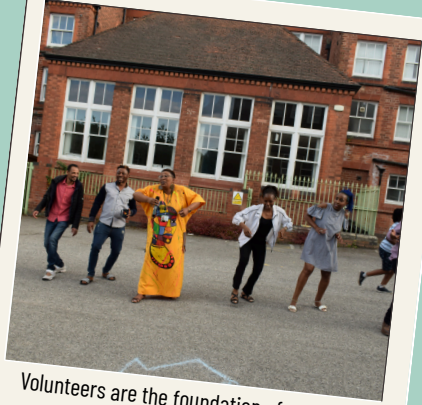
Volunteers are the foundation of our work, giving over 500 hours of their time each week. Almost half have lived experience.