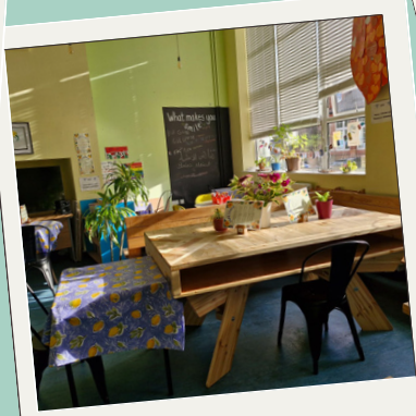
Our bright café serves over 1,000 meals a month.