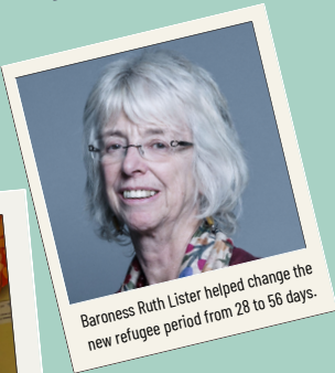
Baroness Ruth Lister helped change the new refugee period from 28 to 56 days.

became a patron for Nottingham Refugee Forum, bringing her valued experience as a member of the House of Lords give our clients a voice in government.