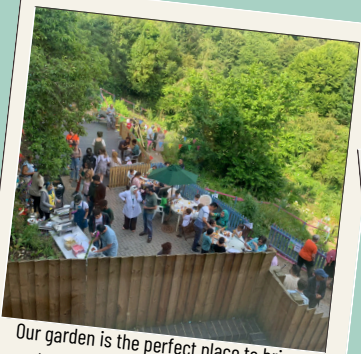
Our garden is the perfect place to bring people together, especially during Refugee Week which we love hosting each year.