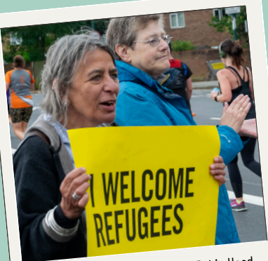
Supporting our runners in the Robin Hood Half Marathon.