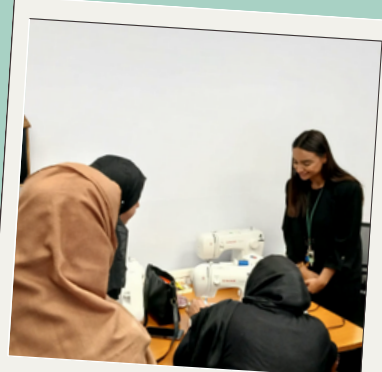
Our resettlement work continues today with us welcoming Afghan refugees.